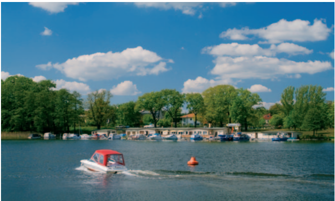
“Water tourism” – boats on Lake Lehnitz

The Havel, the Oranienburg Canal, the Oder-Havel Canal and the Lake Lehnitz are all waters that surround Oranienburg. But it is the river Havel with its canals and moats that forms the blue lifeline of the town. Cycle paths and hiking trails invite visitors to do some sport or to just stroll around. The new castle harbour and other landing places are idyllic oases in the inner town where tourists can berth in the centre of Oranienburg and then continue their journey as far as the Mecklenburg Lake District. Furthermore there is an ultramodern caravan campsite situated directly at the castle harbour.