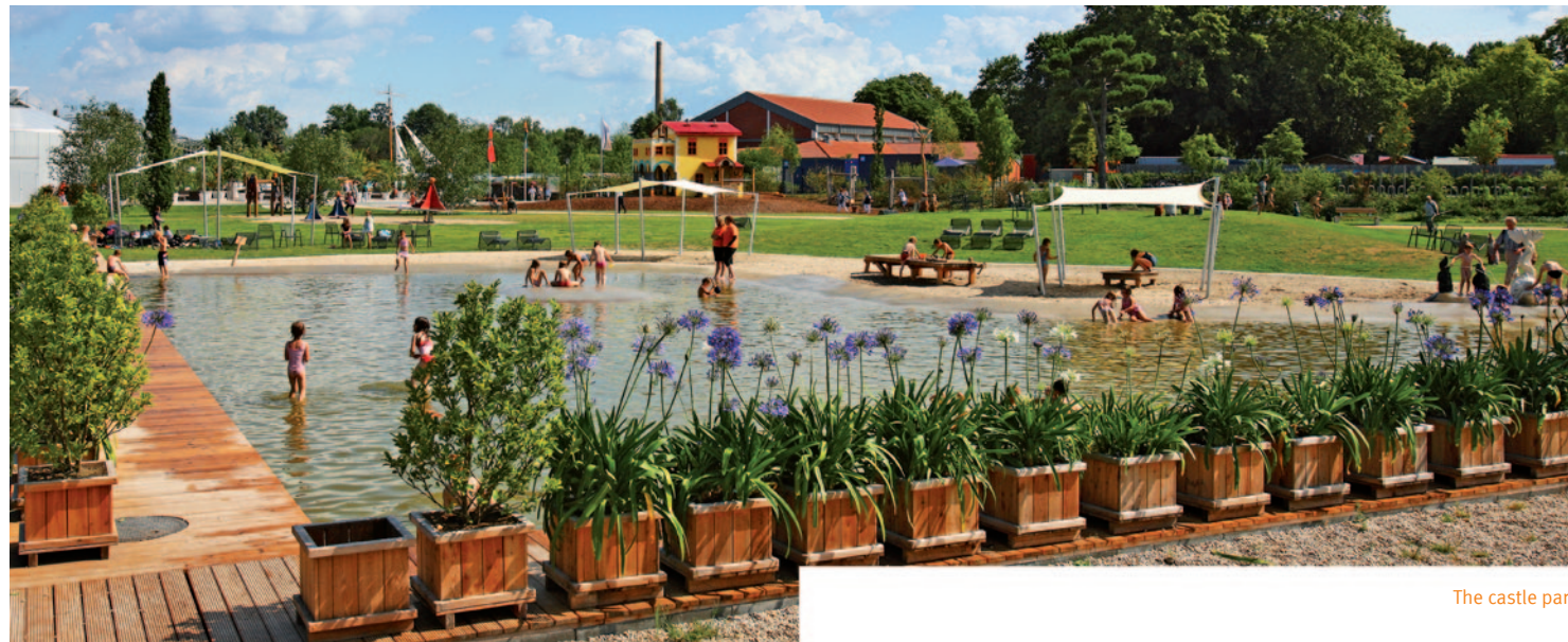
The castle park