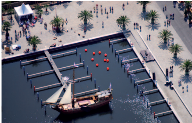
The castle harbour