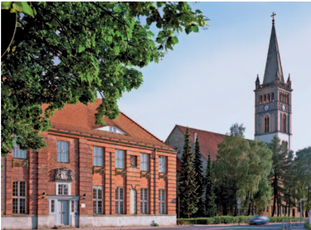
View of the orphanage and the St.-Nicolai-Church

The castle of Oranienburg – the oldest baroque castle in the Mark Brandenburg – is the pulsating heart of the town. It was built in the style of the Dutch Baroque during the reign of the Brandenburg electoral couple Friedrich Wilhelm of Brandenburg and Louise Henriette of Oranien-Nassau in 1652. Louise Henriette was the eponym of the town. Its history and the close relations between Brandenburg and the Netherlands are documented in the two museums inside the castle that are well worth a visit.