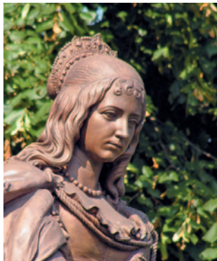
Statue of the electoral princess Louise Henriette

Recently Oranienburg has experienced a stronger economic growth than probably most other towns in Brandenburg have. Most visible from the outside is the extensive reconstruction. But the town is also pleased with the constantly increasing number of its residents due to the settlement of young families who appreciate the combination of metropolis and country. Based on the baroque ground-plan the historical town centre is being revived, historic buildings are being rebuilt, older structures are being replaced and gaps are being closed with attractive new buildings.