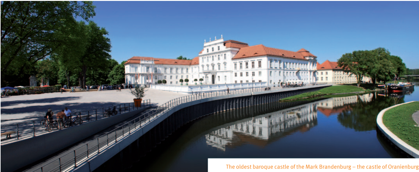
The oldest baroque castle of the Mark Brandenburg – the castle of Oranienburg